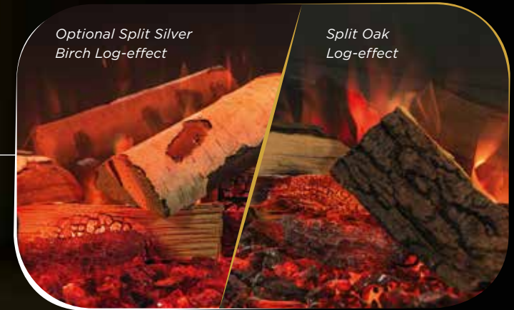
Split Oak Log-effect