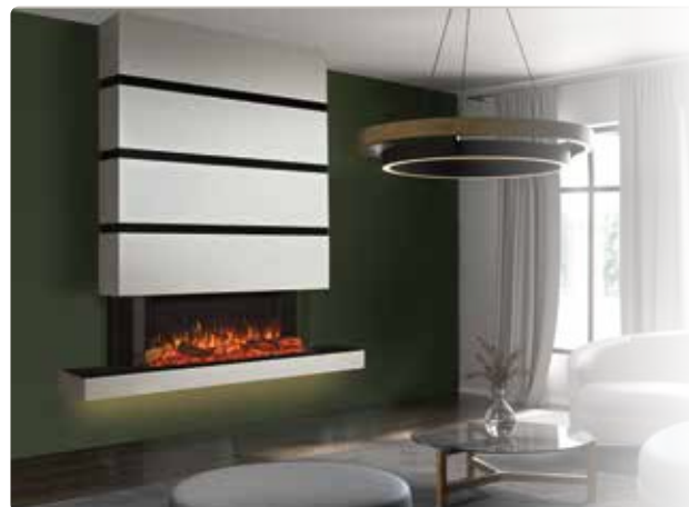
Avanti 110RW with Split Oak Log-effect, installed with Milazzo Suite floating shelf and four top sections in white.