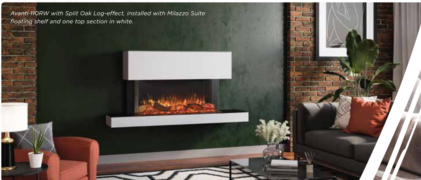
Avanti 110RW with Split Oak Log-effect, installed with Milazzo Suite floating shelf and one top section in white.

Fixing flat against a wall for a quick and easy installation, the Milazzo's modular design can be tailored to create a floating focal point or floor-to-ceiling centrepiece.