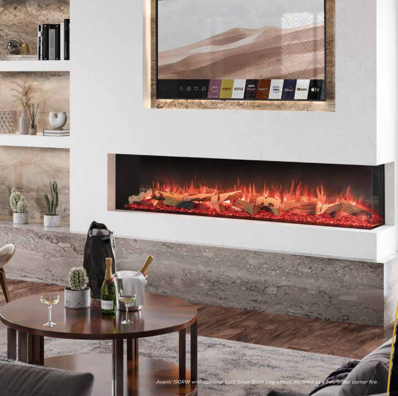
Avanti 190RW with optional Split Silver Birch Log-effect, installed as a two-sided corner fire.