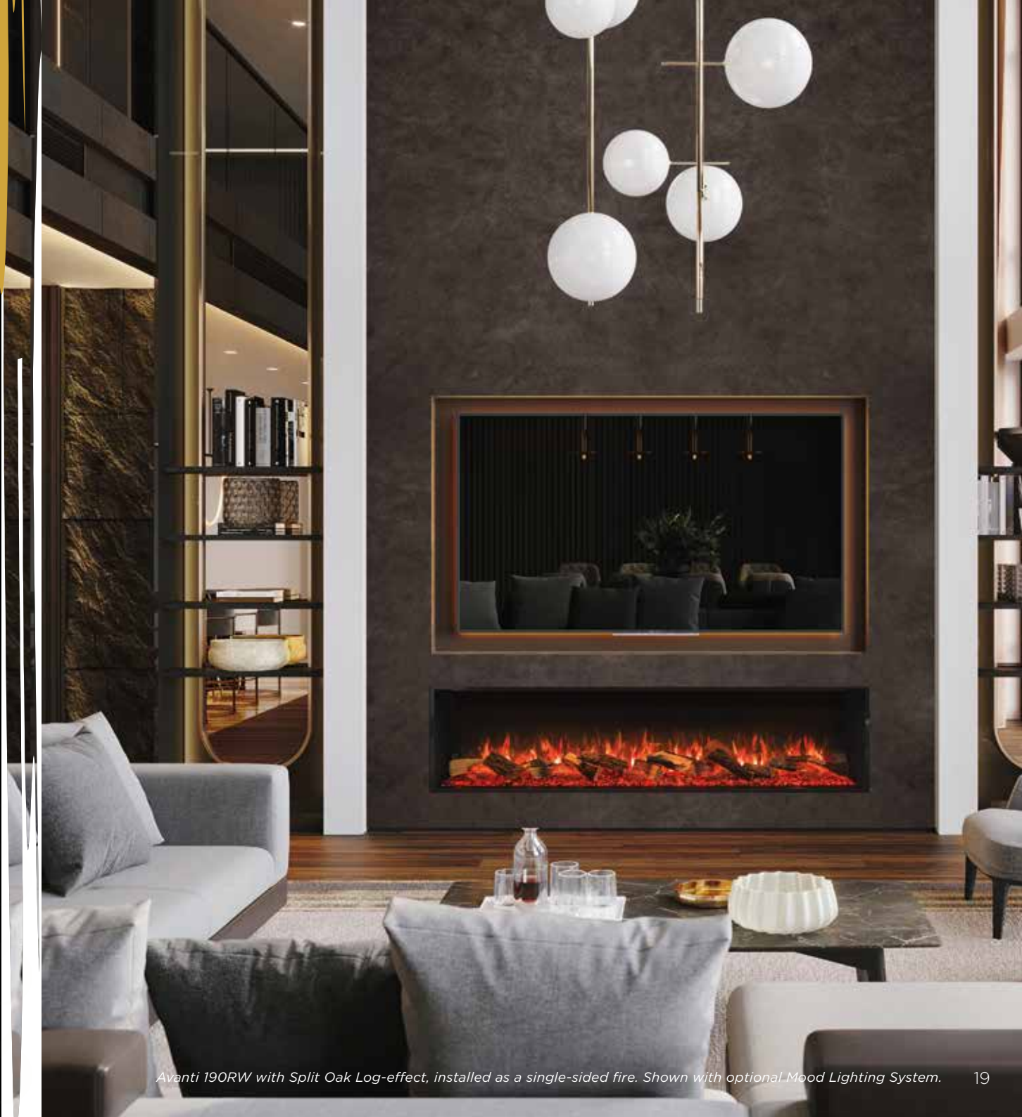
Avanti 190RW with Split Oak Log-effect, installed as a single-sided fire. Shown with optional Mood Lighting System.

See pages 3, 7, 11 & back cover for additional images