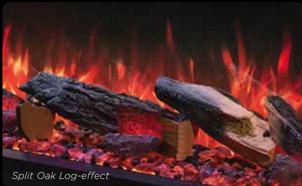
Split Oak Log-effect

See pages 3, 7, 11 & back cover for additional images