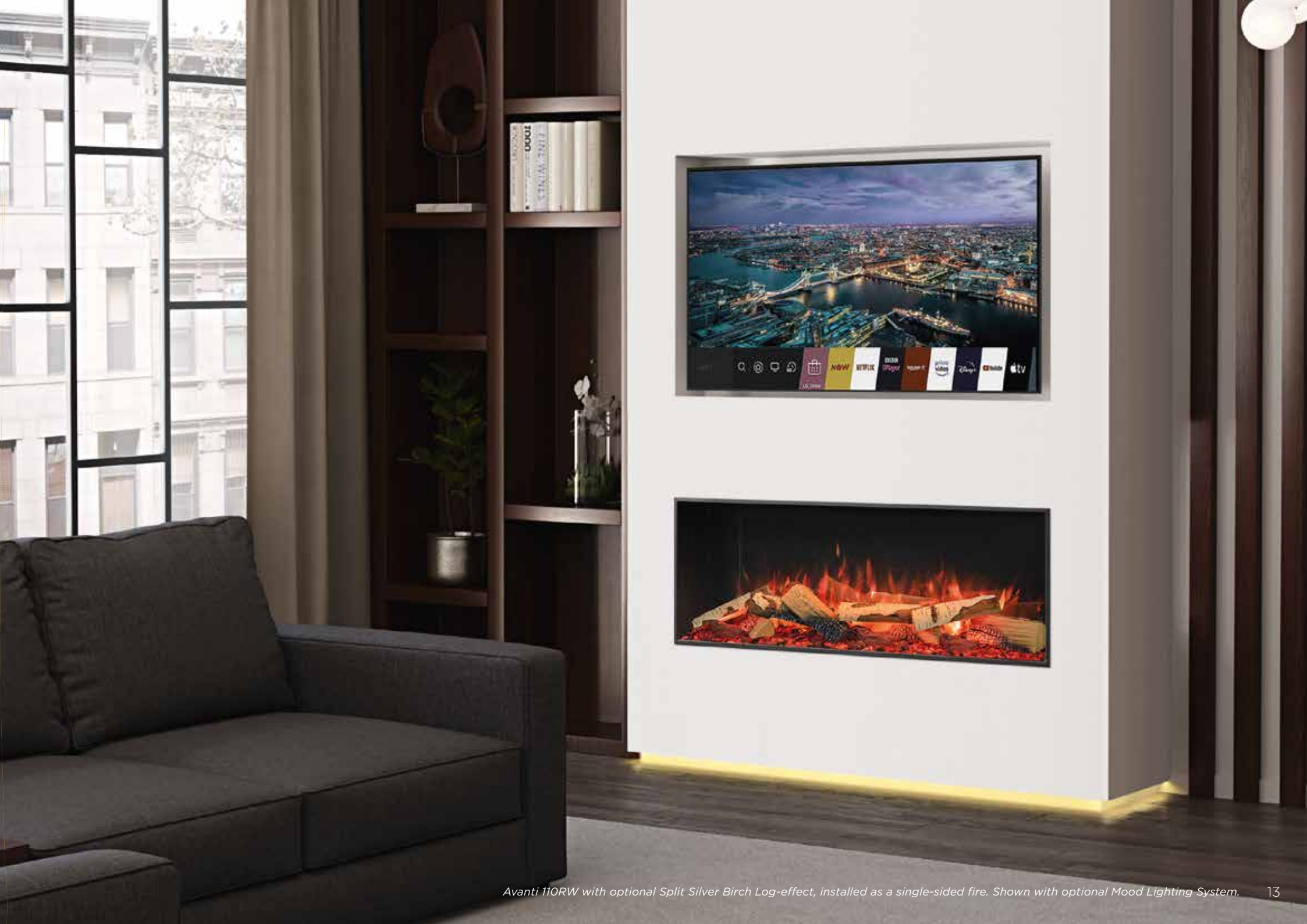
Avanti 110RW with optional Split Silver Birch Log-effect, installed as a single-sided fire. Shown with optional Mood Lighting System.