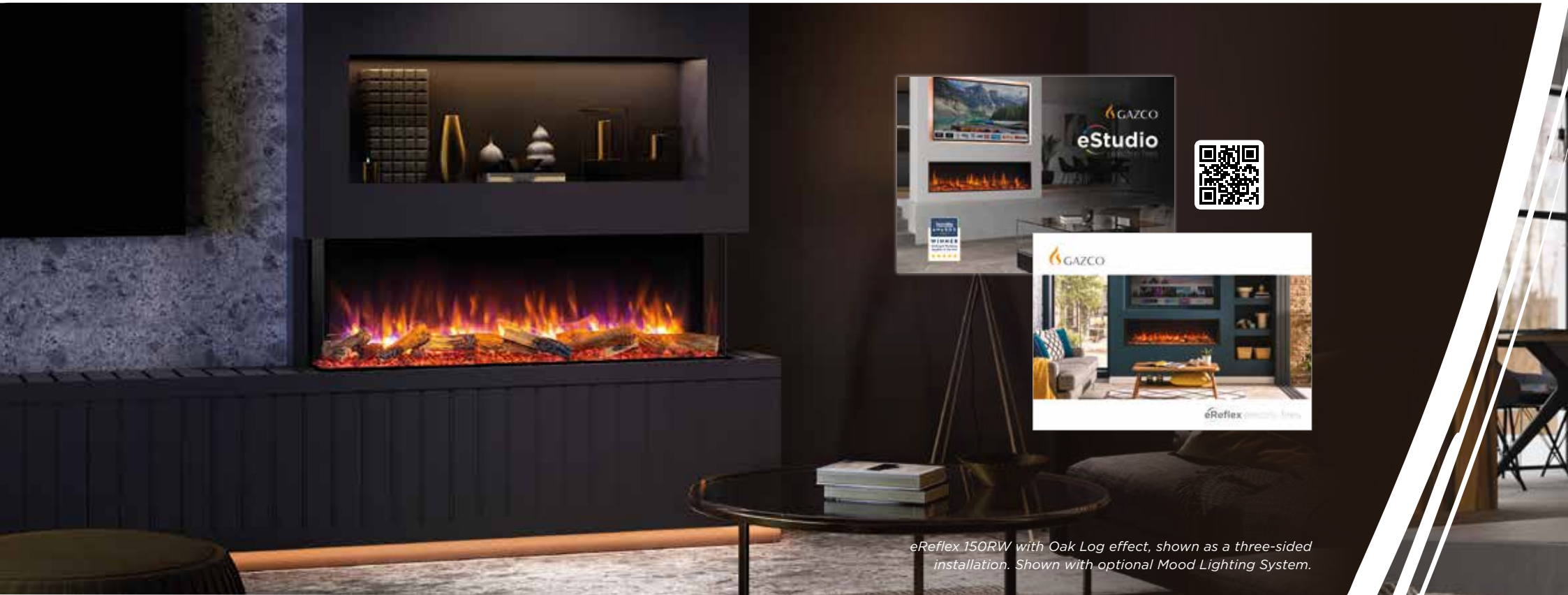
eReflex 150RW with Oak Log effect, shown as a three-sided installation. Shown with optional Mood Lighting System.

The Stovax Heating Group's electric fire collection also includes the Gazco eReflex and eStudio ranges.