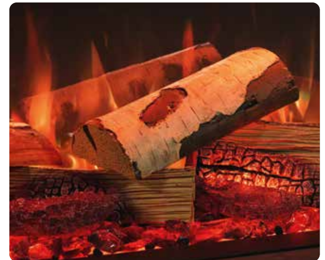
Optional Split Silver Birch Log-effect

Avanti 110RW with Split Oak Log-effect, installed as a two-sided corner fire.